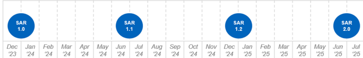
Figure 4: BEAD Milestones and Reporting

The BEAD SAR is designed to reflect information commensurate to each stage of the program. As the grant progresses, NTIA must collect information on current program milestones to effectively perform grant management and oversight duties. As seen in Figure 4 , EEs will need to report on new information in SAR 1.2 and 2.0 as the grant progresses into Initial Proposal Funding Request spending and project build out.