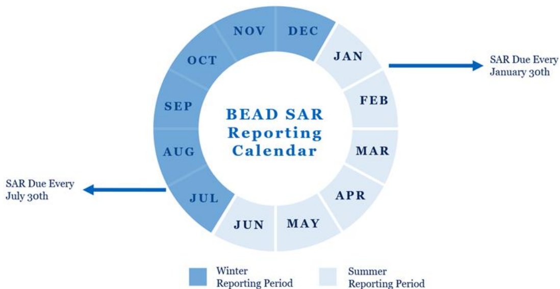
Figure 3: BEAD SAR Reporting Calendar

Note, EEs should be aware of additional reporting requirements aside from the BEAD SAR, including final closeout reports. NTIA will provide additional information on the final closeout report later; according to the BEAD NOFO, EEs must submit a report “ not later than one year after the EE has expended all grant funds received...” that: